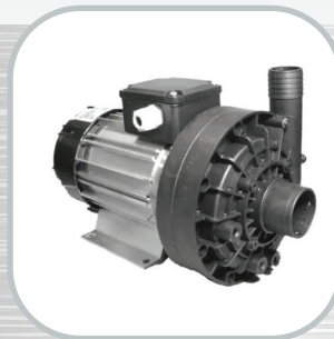
Sirem Wash Pump