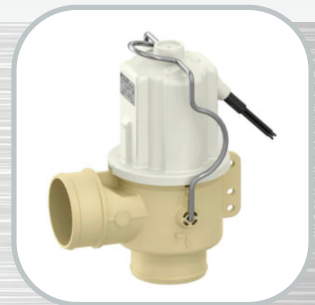
Muller Dump Valve