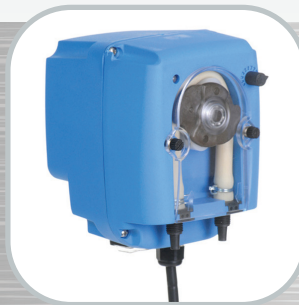
Etatron Chemical Dosing Pump